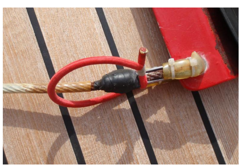
"Soft Tape" used to prevent damage from metal swage with corrosion of wire visible