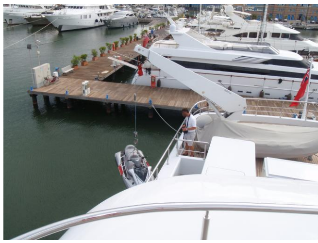
Lowering PWC to Main Deck Level