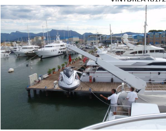
PWC swung over side of yacht