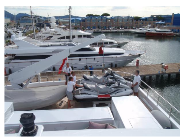
Lifting PWC from cradle