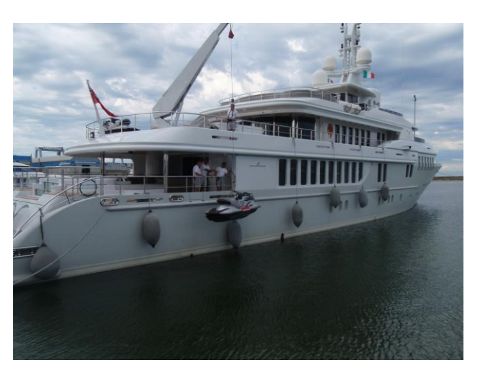
PWC at Main Deck Level where boarded by Deckhand