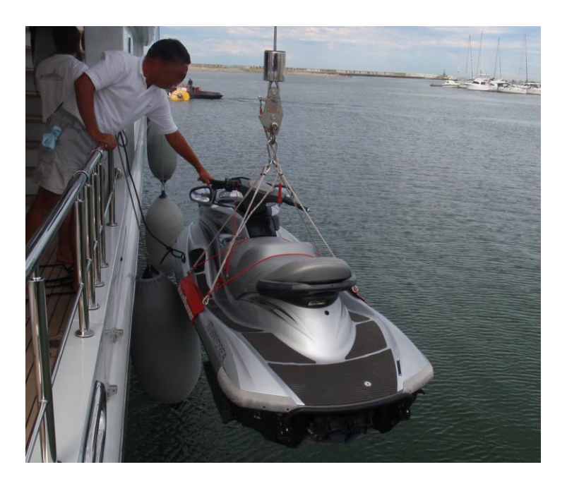
PWC at Main Deck Level where boarded by Deckhand