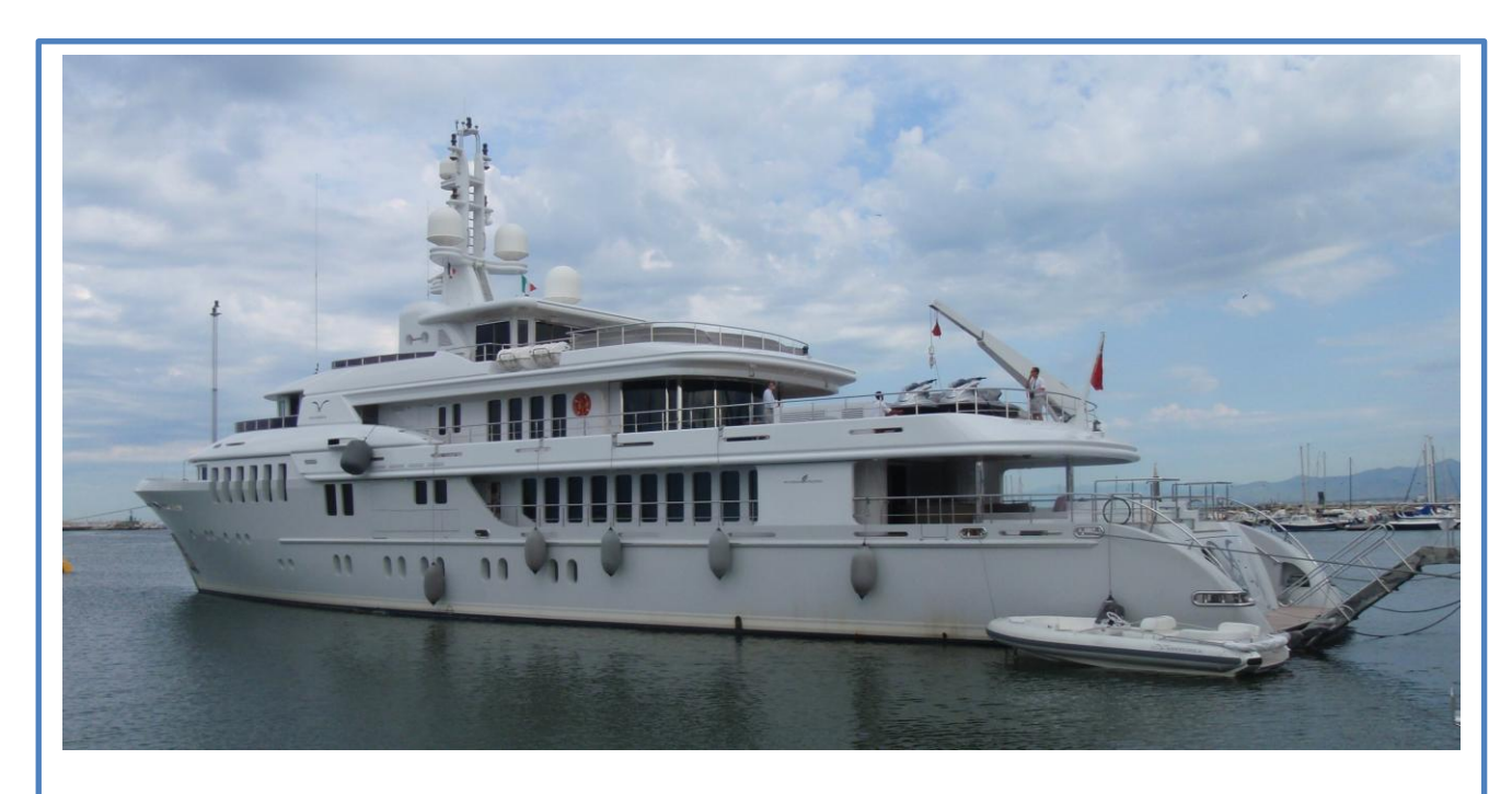
VINYDREA (July 2010)